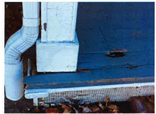
Back Porch views