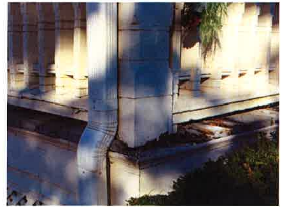
SE Corner of Front Porch