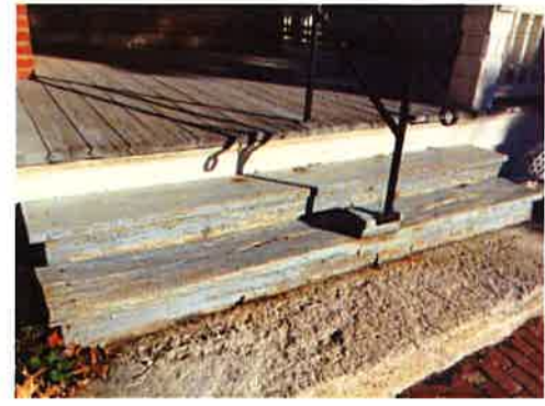
Front Porch South Side Views