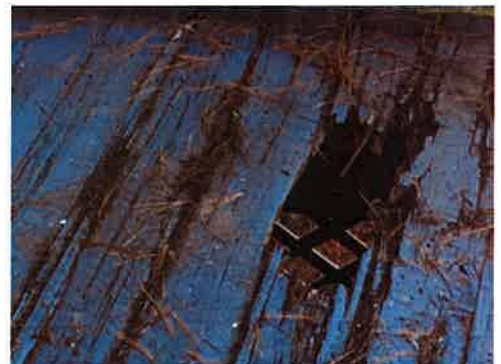
Front Porch South Side views